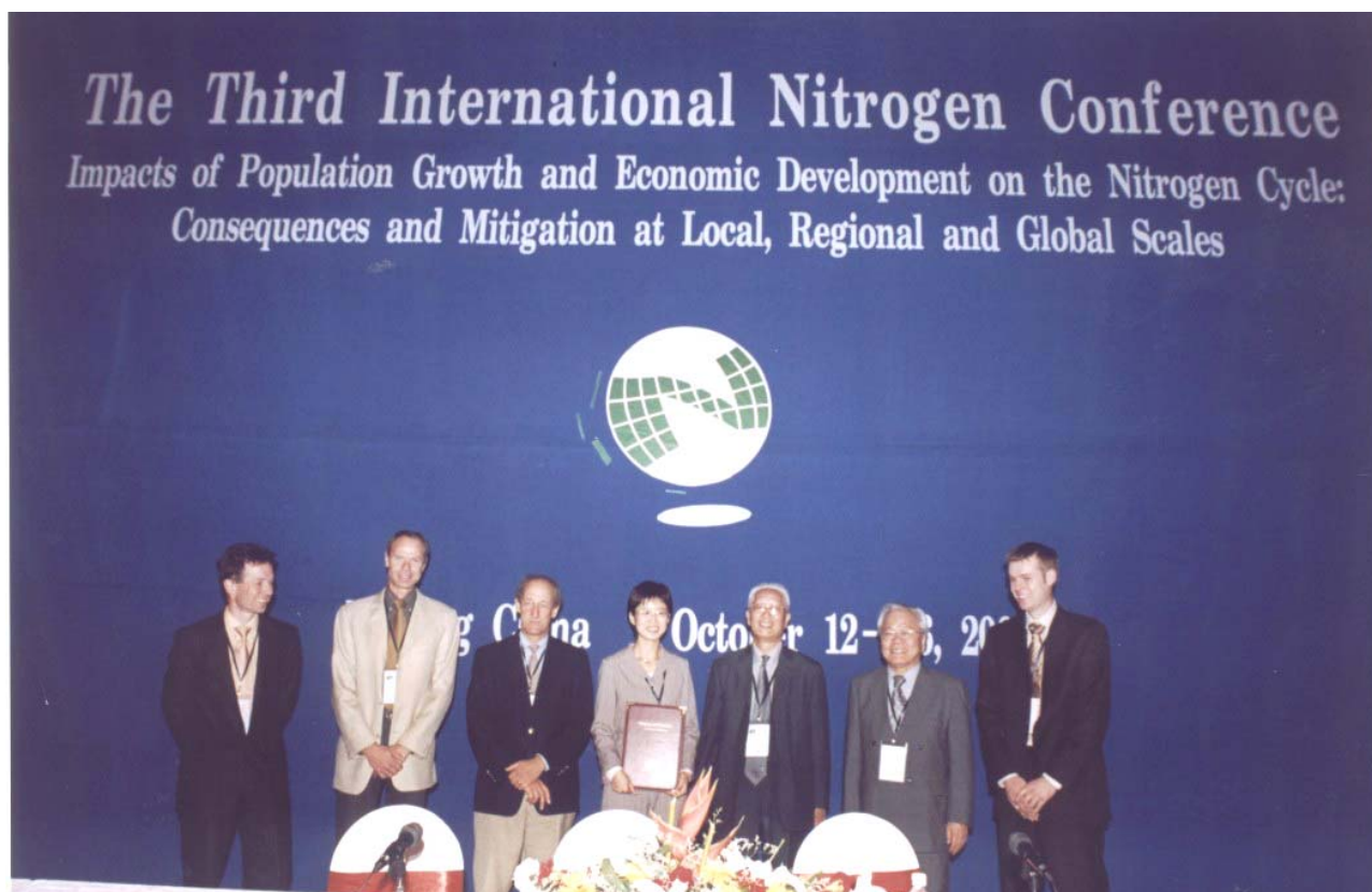
Representative members of the organizing committee of the Third International Nitrogen Conference and the Nanjing Declaration.

growth and economic development on the nitrogen cycle: consequences and mitigation at local, regional, and global scales". Continued increases in population and economic growth, particularly in developing countries, will require commensurate increases in food production and energy demand. Hence, consumption of synthetic N fertilizers and energy will further increase and thus impose even greater pressure on the environment. The main issue of the 2004 conference was whether this increased use of N and energy can be achieved while protecting environmental quality and natural resources for future generations. Because China is the world's biggest consumer of N fertilizers, many papers dealing with the N load derived from agricultural activities, and technologies for its mitigation, were presented.