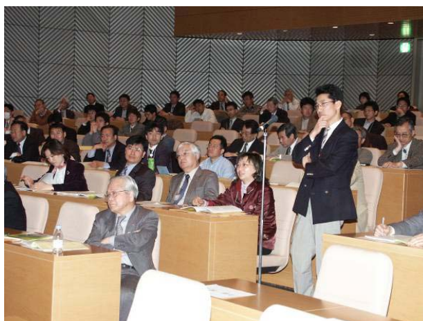
Second International Symposium on Japan–Korea Research Cooperation, held in the Tsukuba International Conference Hall.

The second session, Methodology of Toxicity/Exposure Experiments using Aquatic Organisms, was composed of the following four presentations: 1) “Monitoring and modeling of pesticide fate and transport in paddy fields: challenges for reducing environmental risk” (H. Watanabe, Tokyo University of Agriculture and Technology, Japan); 2) “Hazard assessment of rice herbicides in freshwater algae in Japan” (S. Ishihara, NIAES); 3) “Impact assessment of herbicide runoff from paddy fields on threatened aquatic plants in Japan” (H. Ikeda, NIAES); and 4) “Evaluation of ecological effect of farm chemicals” (F. Heimbach, Bayer Crop Science GmbH, Germany). More than 150 people participated in the seminar.