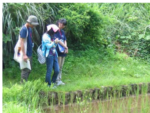
Photo 5 Walking around the field with a GPS recorder