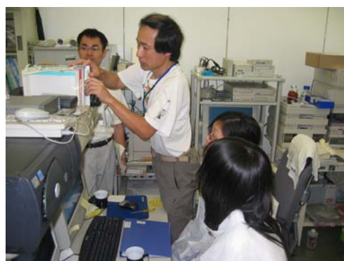
Photo 3 Learning how to calculate the concentration of pollutants

Summer Science Camp 2006 at NIAES took place from 9 to 11 August 2006, with 12 high school students from all areas of Japan. Every student participated in one of the three courses: a) use of mass spectrometry for the ultramicroanalysis of environmental pollutants, b) the study of allelopathy (chemical interactions between plants), and c) the study of the behavior of wild animals with a GPS device. (Photos 3, 4, 5)