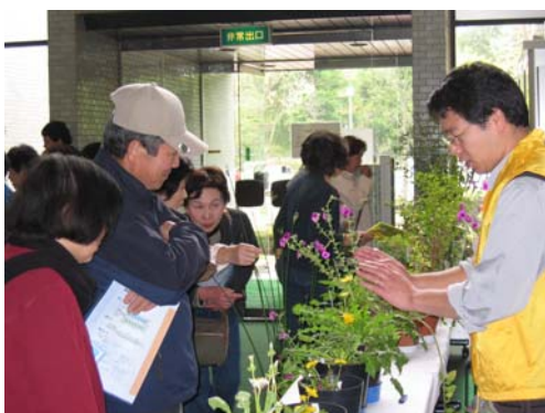
Photo 1 Visitors looking at familiar wildflowers

The Institute opened its doors to the public on 19 April during Science and Technology Week 2006. Visitors including students and various professionals—more than 1200 in total. They studied displays on research topics, watched specimens in the exhibition rooms of the Natural Resources Inventory, attended mini lectures, tried hands-on experiments, and participated in vegetable picking in the field. All events were arranged under the general theme “Let’s hand over sound farmland and environment to future generations.” (Photos 1, 2)