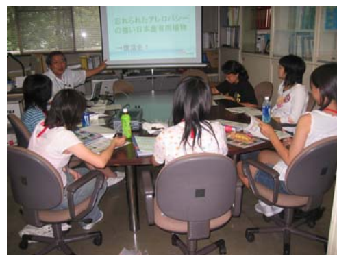
Photo 4 Lecture on the application of allelopathy