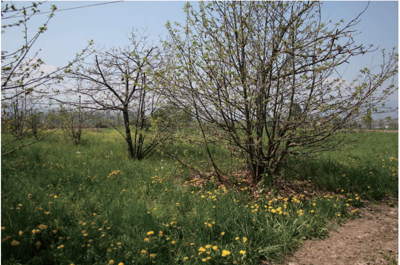
Fig. 2. View of the rearing area